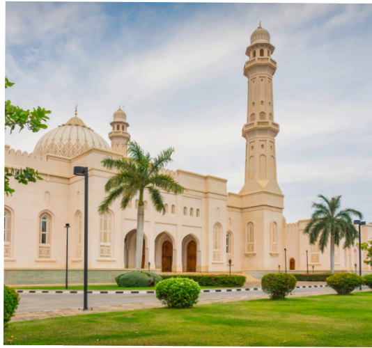
Sultan Qaboos Mosque